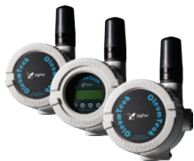
OleumTech Sigfox Ready Transmitters