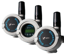
OleumTech Sigfox Ready Transmitters